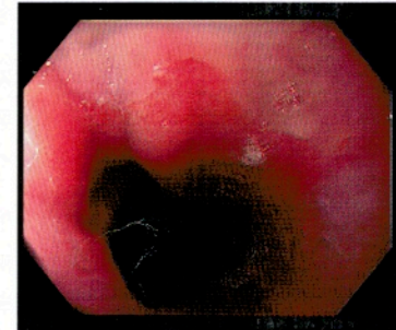
oesophagus | Normal

Duodenum: Small duodenal diverticulum noted in the second part of the duodenum.