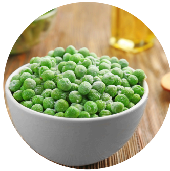
SWEET PEAS (FROZEN)